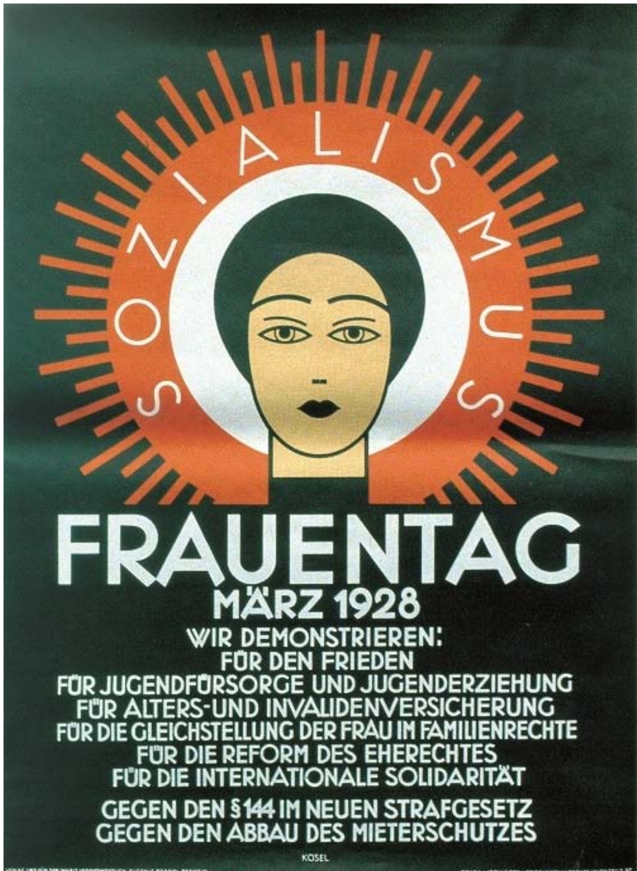
International Women's Day, 1928